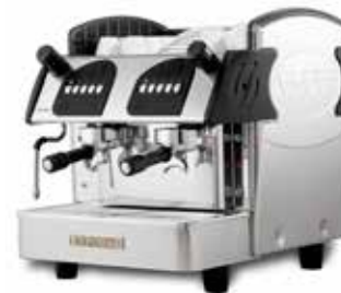
Mini Control 2 GR