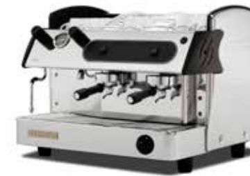
Pulser 2 GR