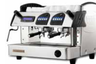
Display Control 2 GR