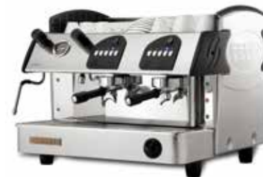
Control 2 GR