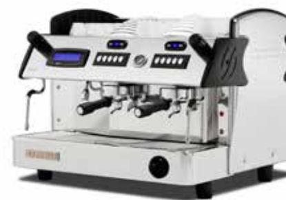
Display Control 2 GR, 3 Boilers