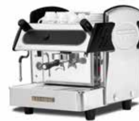
Mini Pulser 1 GR