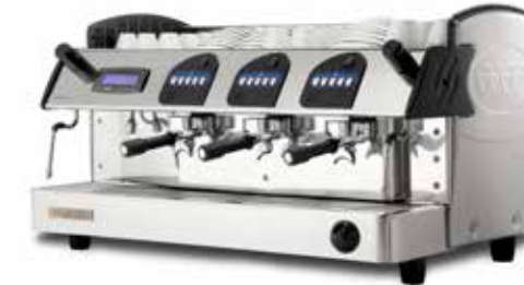
Display Control 3 GR