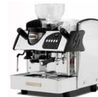
Mini Control 1 GR with grinder